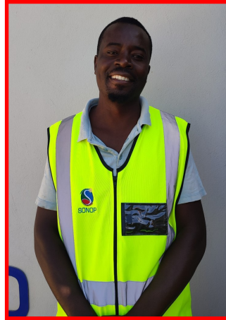
Urombo Ndara Workshop