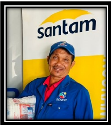
APRIL 24 PETRUS MOLLER WORKSHOP TEAM

Congratulations and thank you for your hard work. We are very proud of you.